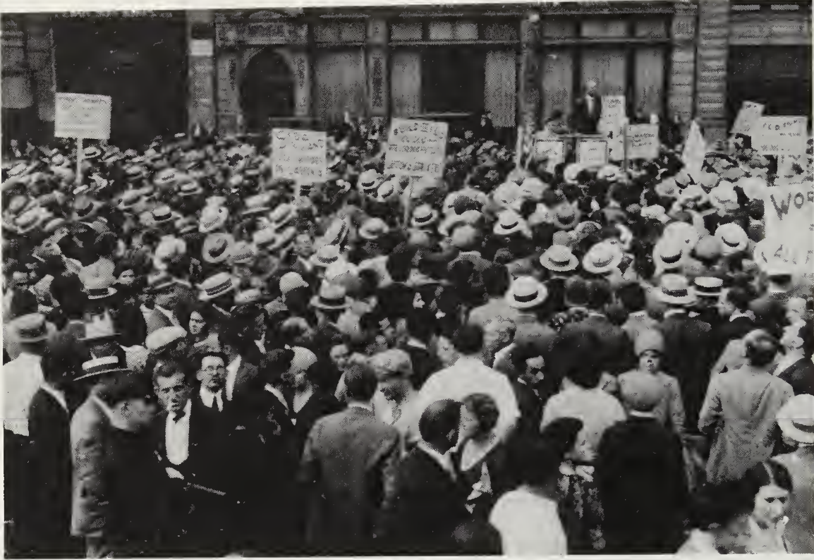
Foster speaking at a huge outdoor rally at Union Square, New York City, on International Unemployment Day, March 6, 1930.