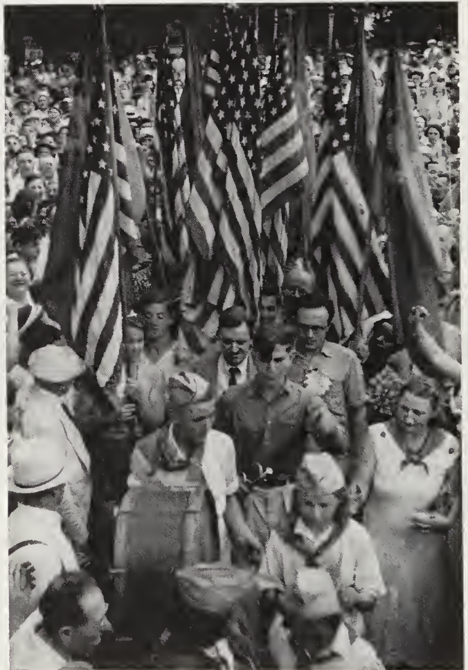
Earl Browder ( behind the drummer ) proclaiming the Popular Front's motto, "Communism is Twentieth Century Americanism," at a July 4, 1937, celebration in Chicago.