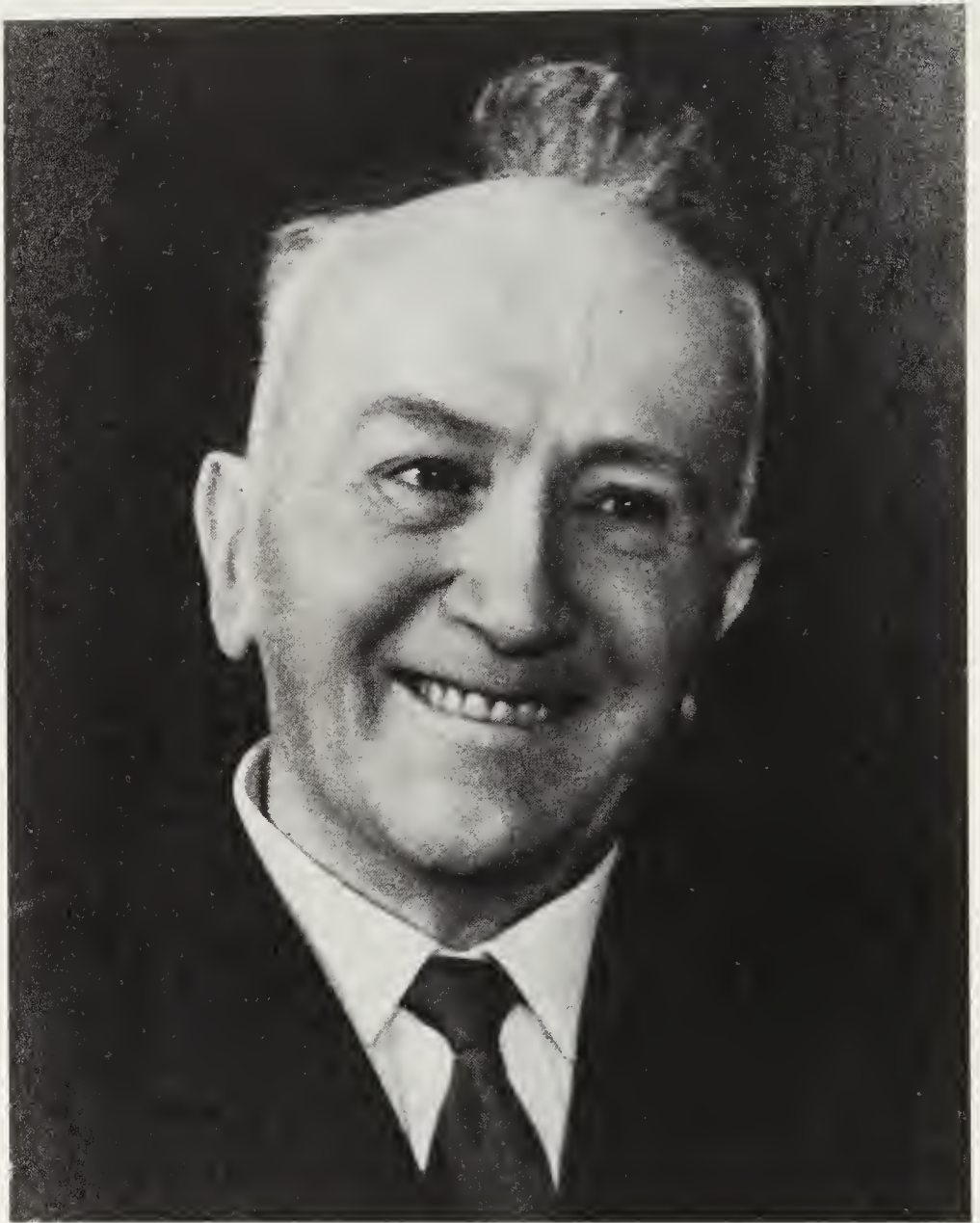
William Z. Foster shortly before his death in Moscow in 1961.