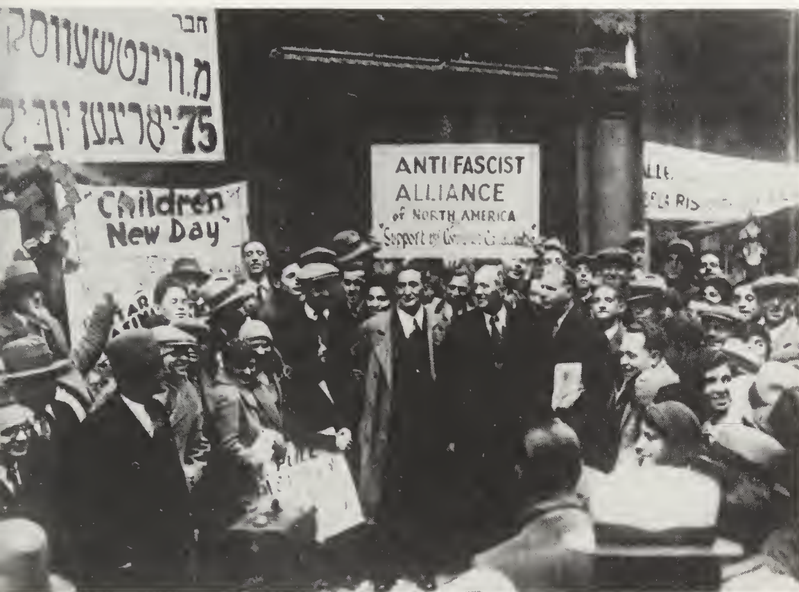
Foster on the campaign trail for the presidency, New York City, 1928.