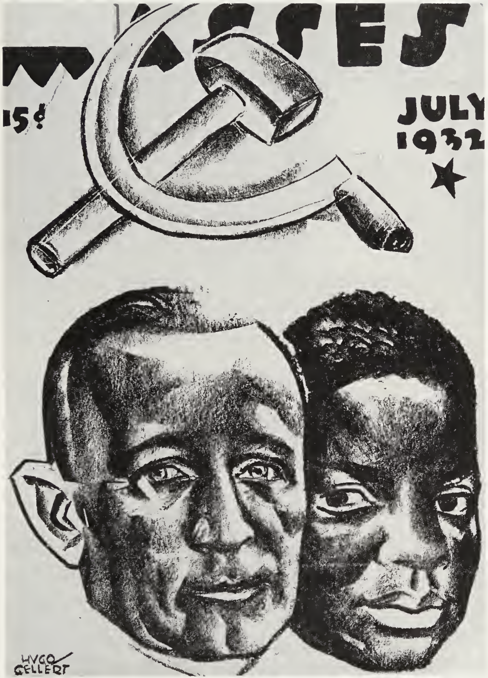
Hugo Gellert's illustration of Foster and James W. Ford, his running mate in the 1932 presidential election, from New Masses , July 1932.