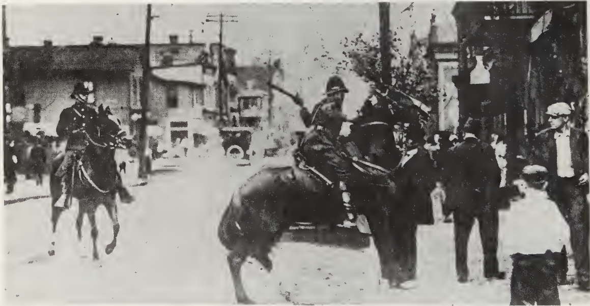
Mounted Pennsylvania state constables attack steel strikers on the streets of a mill town, 1919.