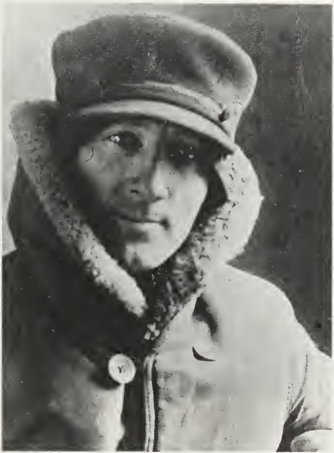
William Z. Foster, one of the “militant minority,” probably in early 1912.