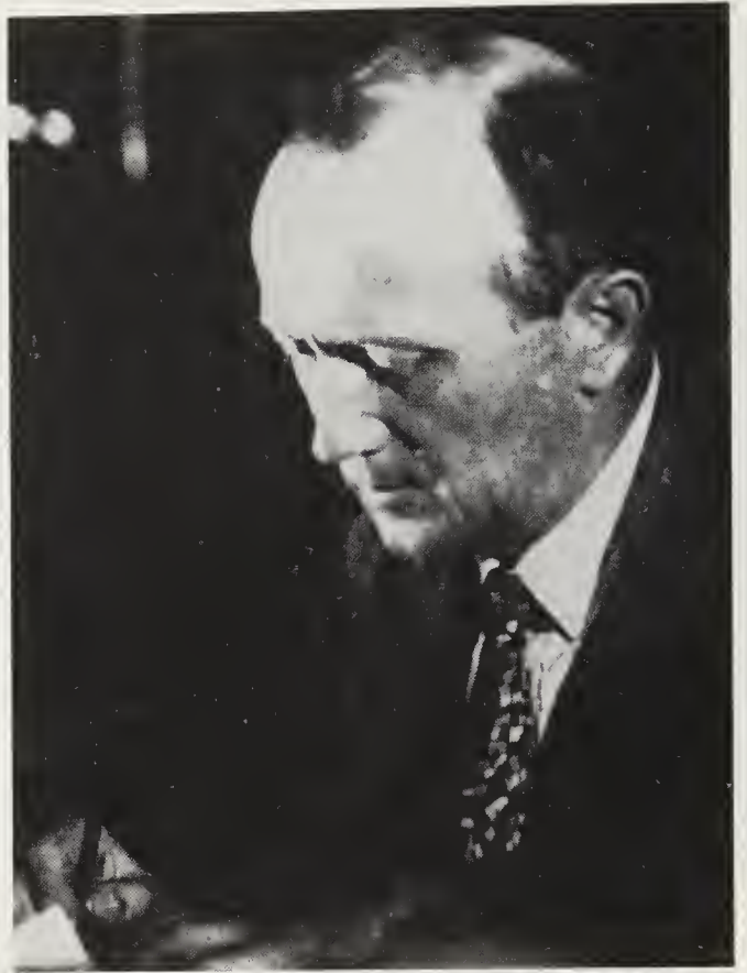
William Z. Foster working at the American Commission of the Communist International, Moscow, 1925.