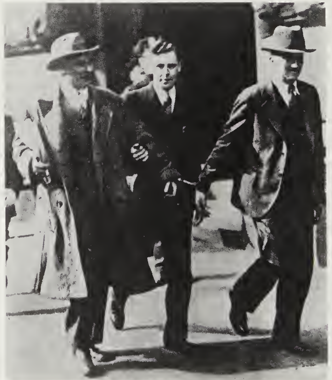
Robert Minor ( far left) and William Z. Foster being led away in handcuffs in New York City, March 6, 1930.